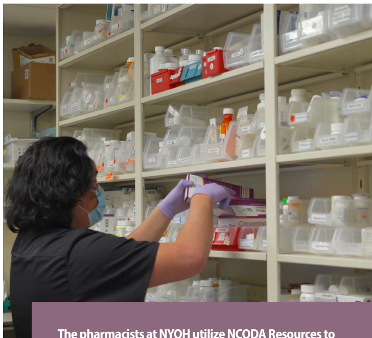
The pharmacists at NYOH utilize NCODA Resources to enhance patient-centered care.

Prior to initiation of an oral anticancer drug, a formalized patient education session should occur with an experienced clinical educator such as a nurse, physician, pharmacist, nurse practitioner, or physician assistant. The discussion should include drug name (generic and brand), drug dose, schedule, potential adverse effects and how to properly manage them, fertility (where applicable), treatment goal, duration of therapy, and financial and affordability considerations. 11